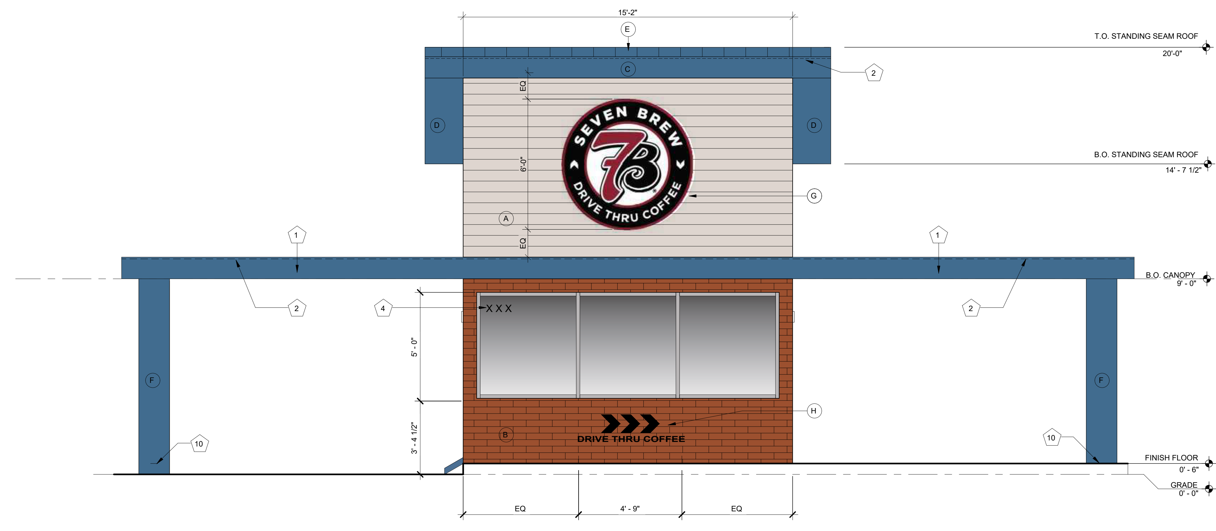
1 EXTERIOR ELEVATION - FRONT 3/8" = 1'-0"