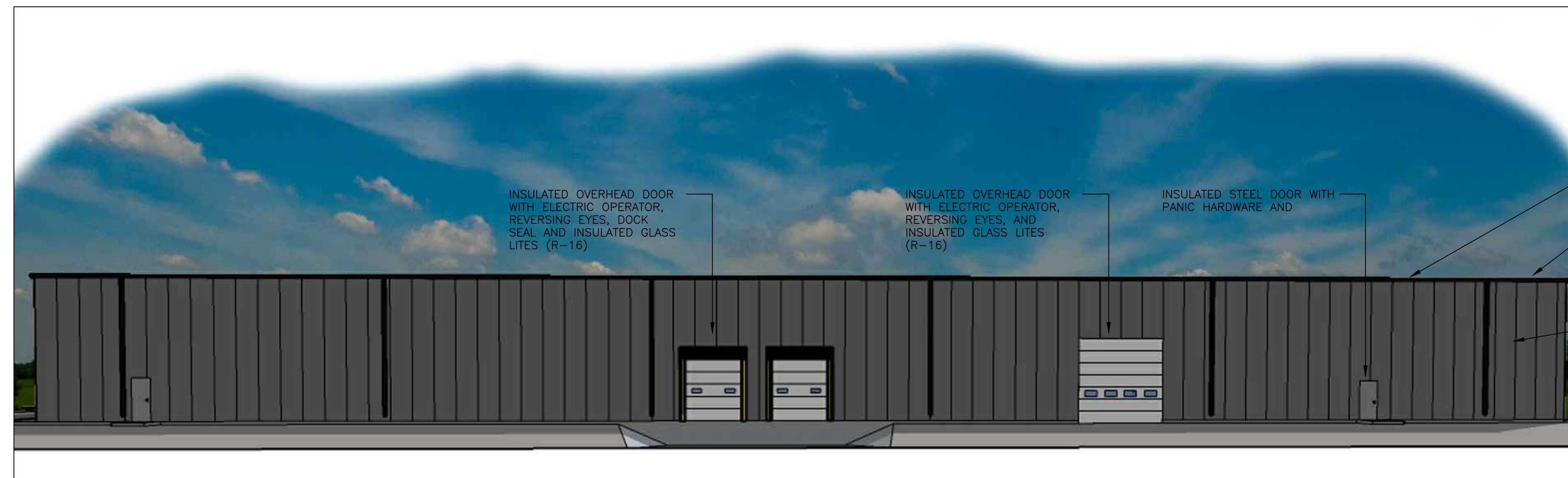
3 - WEST ELEVATION